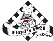
Floyd's 1921 Restaurant